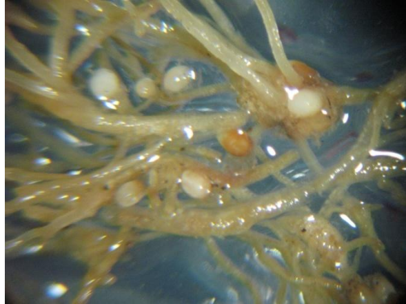
Fig .4. White female of Heterodera avenae on wheat roots about 50 days after emergence