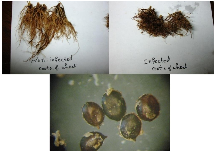
Fig. 5. Shape of roots at harvest and brown cysts. (infected roots are stunted and much branched)

Similar findings were also obtained by Baklawa et al. (2012),-who performed a survey on H.avenae in wheat production areas in Ismailia and reported that, H.avenae was detected in five out of seven regions in East and West Ismailia. Data also indicated that H.avenae occurred in sandy, loamy sand and sandy loam soils, but not in clay or loamy claysoils.Previous results showed also that H.avenae distribution and damage were clearly influenced by soil type (Kort, 1972; Meagher, 1972; Swarup and Sosa-Moss, 1990). H.avenae was only detected in the light-textured well drained soils such as sandy, solonized and brown soils and the grey clay but friable soils in Victoria, Australia, while it has not been detected in the heavy, poorly-structured soil in other