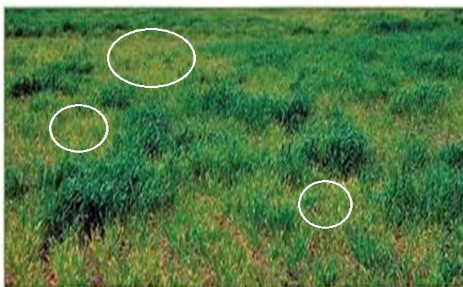
Fig. 2. Symptoms of Heterodera aveane infection in the field about 40-50 days after emergence. (Appearance of patches with stunted plants with a pale green color.

FO% = (number of positive samples/total number of collected samples) * 100